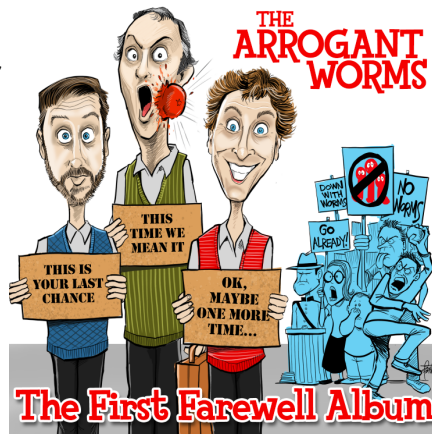
The First Farewell Album